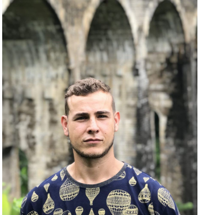
Nine Arch Bridge, Sri Lanka